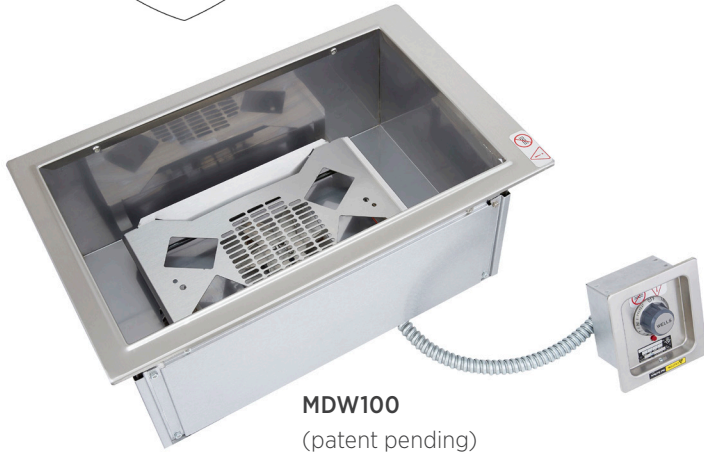
MDW100 (patent pending)