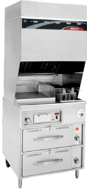
Model WV-FGRW Shown